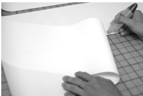
3. Use glue to combine a few sheets of fax paper into one large one.