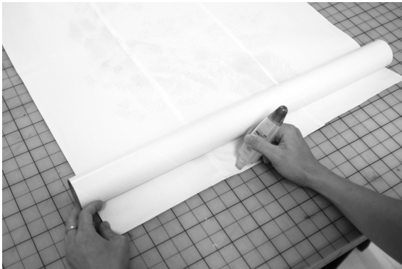
7. Glue fax paper onto mailing tube.