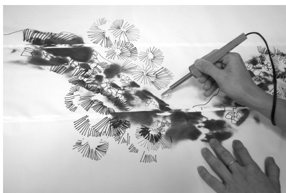
6. Use the heated nozzle of a soldering iron for fine lines. Be careful. Unplug cord if iron get too hot.