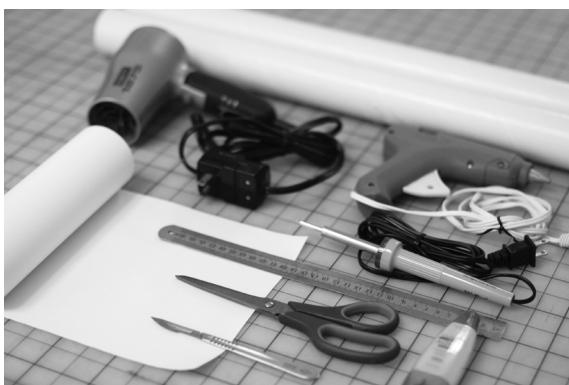
1. These are the materials you will need.