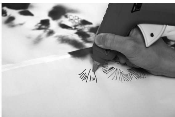
5. Use the heated nozzle of a glue gun for medium lines.