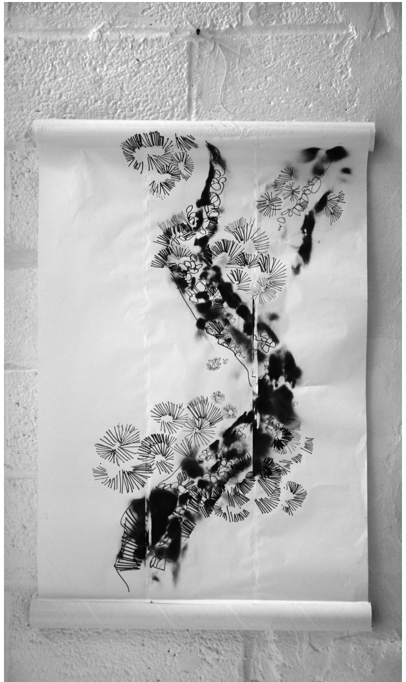
9. Enjoy the wonderful wall hanging.