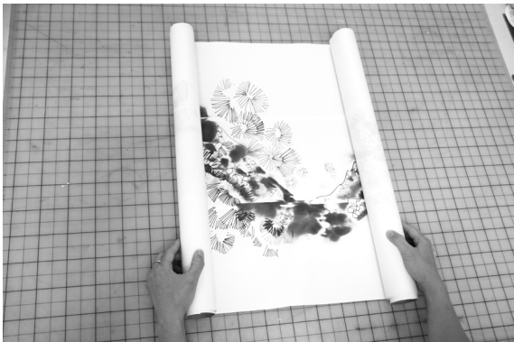
8. Repeat action on both ends.