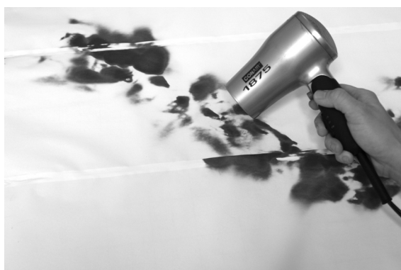
4. Turn on hair dryer and aim at fax paper. Watch bold and fuzzy marks appear.